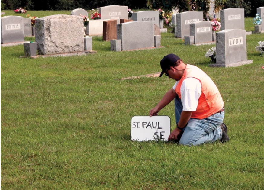
QC When taking digital photos of a monument, make sure to capture a vicinity view, a medium close view showing the area immediately adjacent to the monument, and a close-up view of the monument showing any markings or tags.