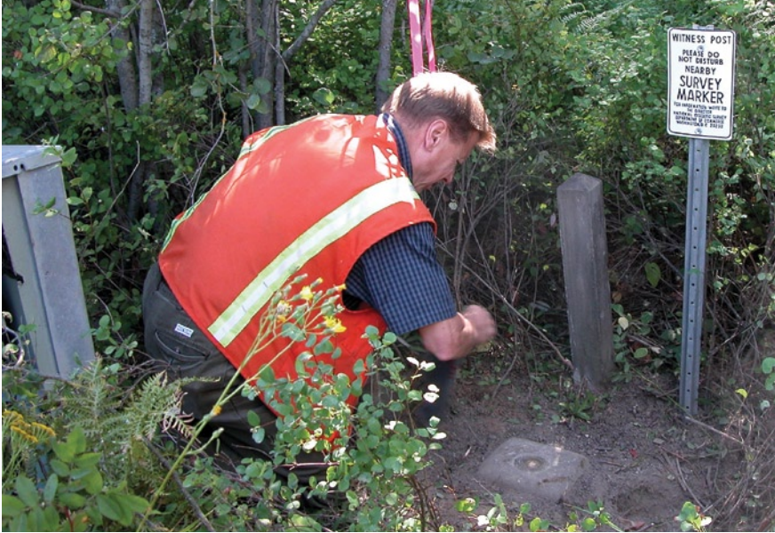
QA Take pencil rubbings of the station mark, copy to a PDF file, and store with the project data.

and mapping. These steps may be defined as: