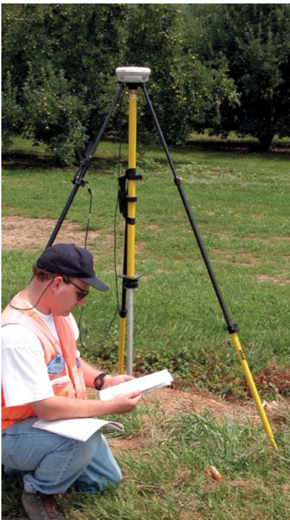
QC Verify the station and monitor the data collection during the survey.