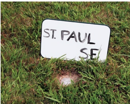
QC Medium close view