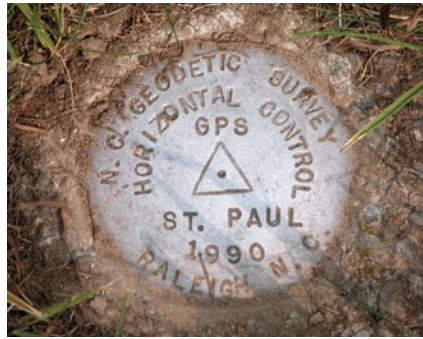
QC Macro view

required by the client for the project. They may include CADD standards, drafting styles, and the level of confidence (sigma) required for the data. Your firm's standards are those developed by you for your local conditions or in-house operations. These standards focus on client service, communication, reporting, documentation, and the use of advanced technology, such as GPS, LIDAR, Ground Penetrating Radar and safety. When preparing a work plan you will need to consider all three types of standards and communicate these evaluations and decisions to the client prior to approval of the plan or acceptance of the assignment.